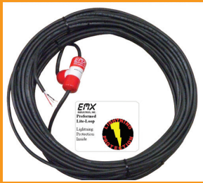
PR-XX (lite preformed loop with lightning protection)