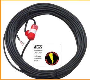
PR-XX (lite preformed loop with lightning protection)