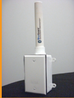
BlueGuard® installed on U-BOX (optional)