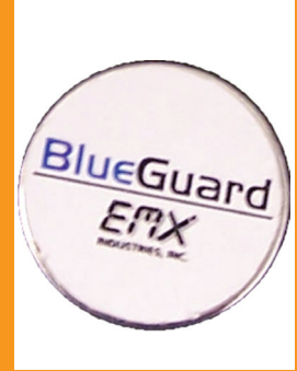
Magnet for programming