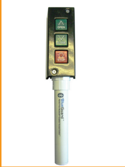
BlueGuard® installed on 3 button station