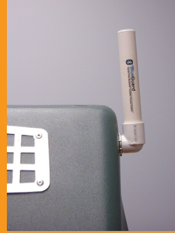
BlueGuard® installed on a gate operator