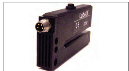
Industry standard connector, wiring and mounting configuration

WARRANTY EMX INC. the product described herein for a period of 2 years under normal use and service from the date of manufacture. The product will be free from defects in material and workmanship. This warranty does not cover ordinary wear and tear, abuse, misuse, overloading, altered products, or damage caused by the purchaser from incorrect connections, or lightning damage. There is no warranty of merchantability. There are no warranties expressed, implied or any affirmation of fact or representation which extend beyond the description set forth herein. EMX Inc. sole responsibility and liability, and purchaser's exclusive remedy shall be limited to the repair or replacement at EMX's option of a part or parts not so conforming to the warranty. In no event shall EMX Inc. be liable for damages of any nature, including incidental or consequential damages, including but, not limited to any damages resulting from non-conformity defect in material or workmanship.