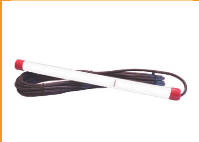
Probe-XX (Probe XX= lead wire length)