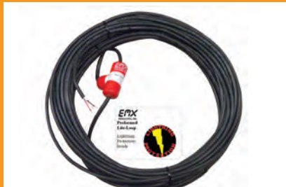
PR-XX (light preformed loop with lighting protection)

The ULTRAMETER™ display makes installation, set-up and troubleshooting easy. Each time a vehicle is moved onto the loop, the display indicates the sensitivity necessary to detect vehicle. Simply set the sensitivity to the value displayed to detect the vehicle. Interference or crosstalk from adjacent loops or other sources are displayed as a constantly varying number on the ULTRAMETER™. This condition may be avoided by maintaining a minimum of 5 kHz separation in multi-loop applications.