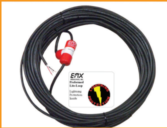
PR-XX (light preformed loop with lightning protection)