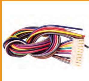
HAR-7 Female Harness