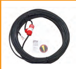
EMX Lite Preformed Loop