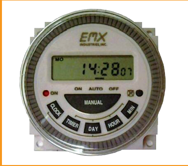
ETM-17 Digital Timer