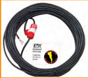
PR-XX (lite preformed loop with lightning protection)