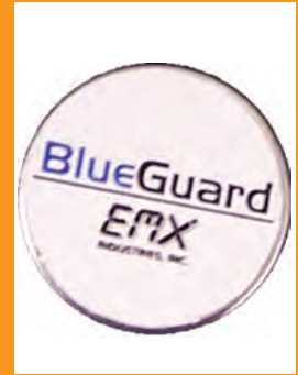
Magnet for programming