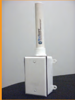
BlueGuard® installed on U-BOX (optional)