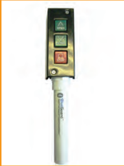
BlueGuard® installed on 3 button station