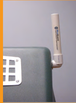
BlueGuard® installed on a gate operator