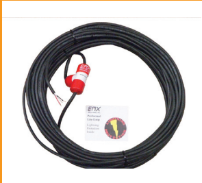
EMX Lite Preformed Loop