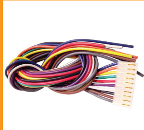
HAR-7 Pin Female Harness