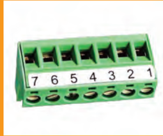
LD-7P 7 position plug terminal for wiring (included)