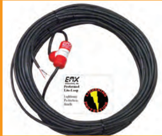
PR-XX (light preformed loop with lighting protection)

The ULTRAMETER™ display makes installation, set-up and troubleshooting easy. Each time a vehicle is moved onto the loop, the display indicates the sensitivity necessary to detect vehicle. Simply set the sensitivity to the value displayed to detect the vehicle. Interference or crosstalk from adjacent loops or other sources are displayed as a constantly varying number on the ULTRAMETER™. This condition may be avoided by maintaining a minimum of 5 kHz separation in multi-loop applications.